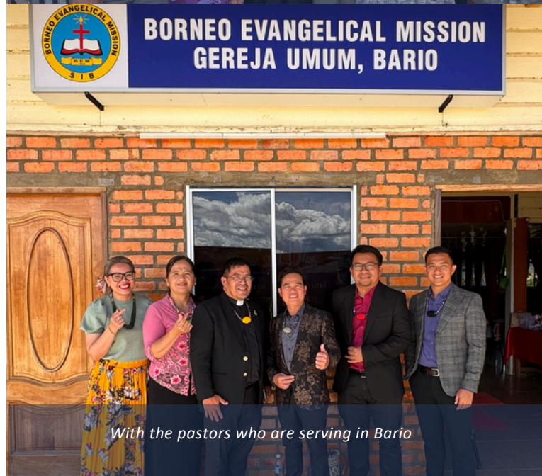
With the pastors who are serving in Bario