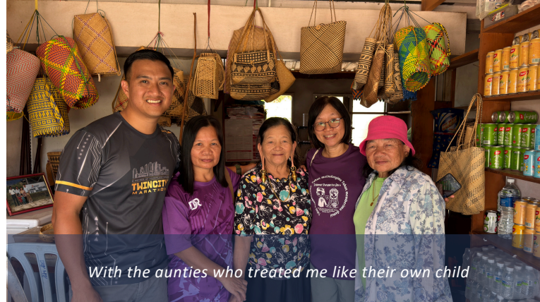
With the aunts who treated me like their own child