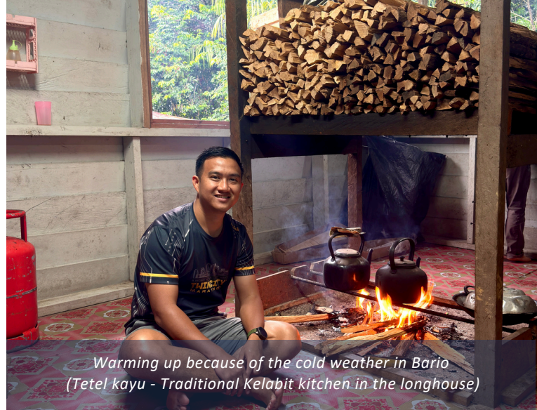
Warming up because of the cold weather in Bario (Tetel kayu - Traditional Kelabit kitchen in the longhouse)

Bario taught me that sometimes God brings us far away, not to help us escape, but to shape us, restore us, and remind us of our true calling.