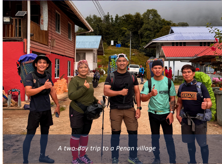
A two-day trip to a Penan village