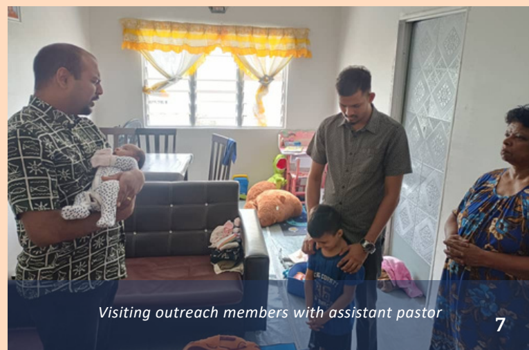
Visiting outreach members with assistant pastor

One of the most meaningful and impactful experiences during my FE was working alongside the assistant pastor in visiting church members from our main church and outreach ministry. Through these visits, I encountered families from different backgrounds and complex family situations. Listening to their testimonies deeply moved me, as many shared stories of pain, perseverance and faith during times of difficulties. I truly appreciate what God has done in my life through hearing these testimonies and they have moved my heart to want to help and support others in any way that I can. Overall, my FE experience has shaped my faith, deepened my compassion, and reaffirmed my desire to serve God and His people.