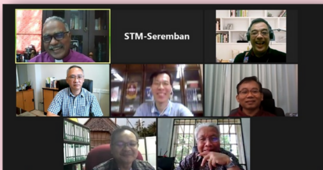
Dialogue with the Heads of sponsoring churches in Sabah and Sarawak.

The current situation and future plans of STM were updated during the meetings, some of the concerns and suggestions were being brought up by the church leaders and donors too. It was good fellowship, we hope more invitees can turn up for the next round of dialogue.