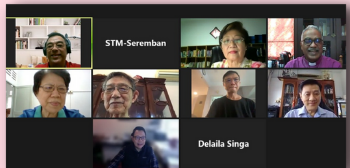
Dialogue with the STM Friends.