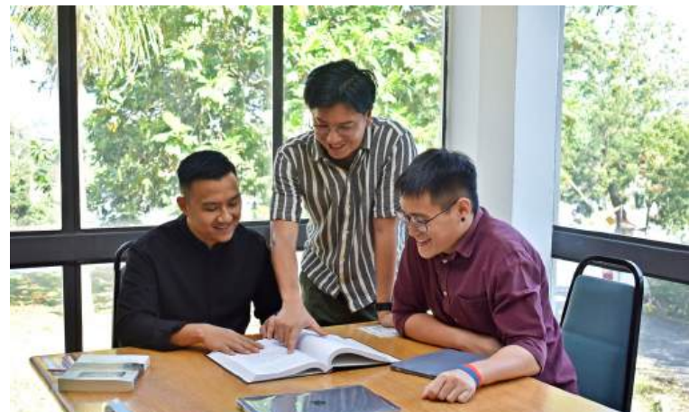
Our students are using the books and facilities available at the STM library