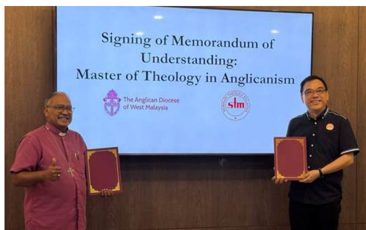
20 March - MOU signing between STM and the Diocese of West Malaysia (DWM) for the Master of Theology (MTh) in Anglicanism.