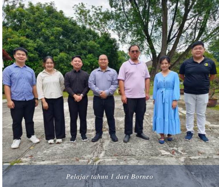
Pelajar tahun 1 dari Borneo

Dari zaman kanak-kanak sehinggalah zaman kolej, nama STM tidak dapat disenyapkan di telinga saya. Sepanjang saya menyertai aktiviti remaja di peringkat Diocese of West Malaysia, khususnya bahagian Lembaga Bahasa Malaysia & Orang Asal, banyak pihak akan bertanya, "bilakah kamu akan menjadi paderi?". Situasi ini, membuat saya merasa agak janggal. Saban tahun, terdapat beberapa kali saya mengabaikan panggilan Tuhan dan sering mengikuti kehendak sendiri.