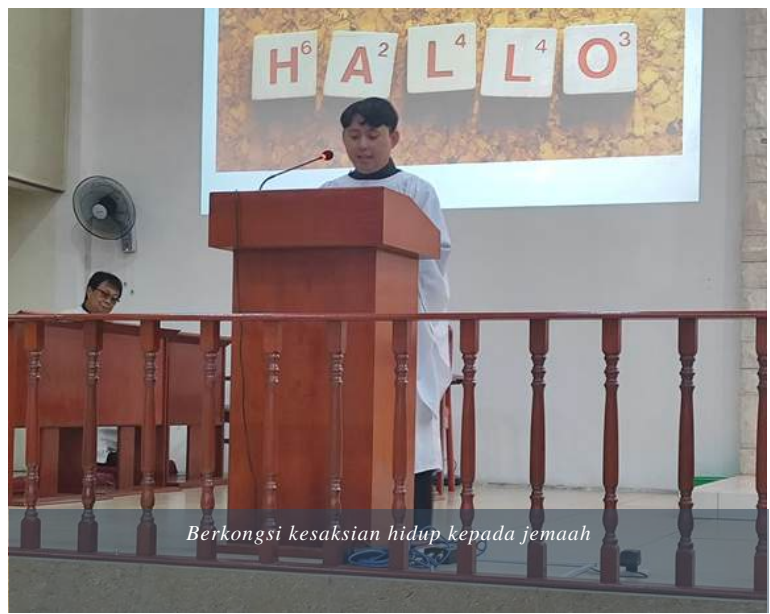
Berkongsi kesaksian hidup kepada jemaah

Saya berdoa semoga dengan usaha ini, lagi banyak jiwa disedarkan oleh Allah dan memberikan diri untuk kemuliaan-Nya yang ilahi. Biarlah kasih Allah dinyatakan di pelbagai tempat, Amin!