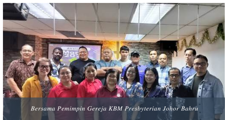
Bersama Pemimpin Gereja KBM Presbyterian Johor Bahru