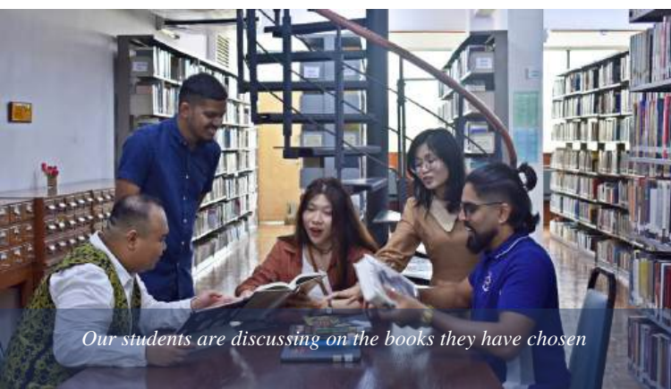
Our students are discussing on the books they have chosen